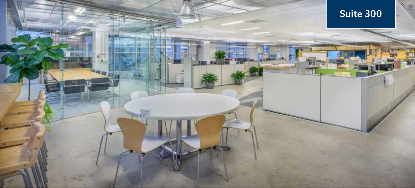
Modern build-out, panoramic views, all glass conference room, break room, & concrete flooring.