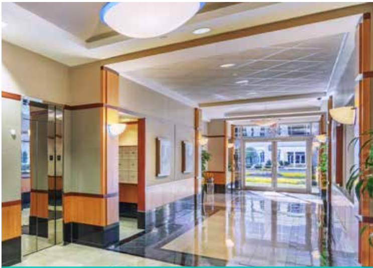
Elegant Lobby with Vaulted Ceilings & Mahogany Panels